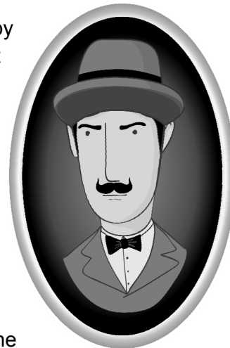
Portrait of Hercule Poirot

The Golden Age of the detective novel is considered to be between 1920 and 1940. The Queen of Detective Fiction for this period is surely Agatha Christie. She wrote 66 mysteries, 6 novels, 150 short stories, 18 plays and 2 memoirs. Her work has been translated into more than 100 languages. Her books have sold more than 2 billion copies. This is exceeded only by the Bible and the works of Shakespeare. Agatha Christie died in 1976.